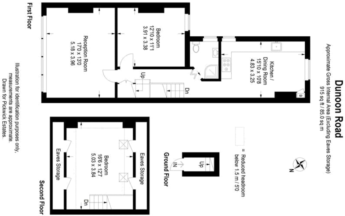
Illustration for identification purposes only, measurements are approximate. Drawn for Pickwick Estates.